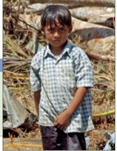
Searching for answers amid the devastation 4