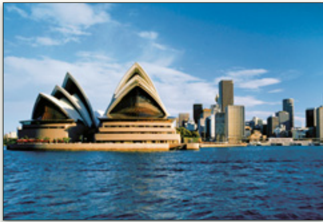
The magnificent Sydney Opera House, overlooking Sydney's harbor, is a symbol of Australia's place among the modern Western nations. At left, an Australian soldier stands watch while on duty in Iraq. Australia has been a strong military ally of Britain and the United States.

look to the United States as its principal ally in the Pacific theater. As World War II Prime Minister John Curtin declared: "I make it quite clear that Australia looks to America, free from any pang about our traditional links of friendship to Britain."