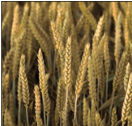
A harvest ceremony that teaches about Jesus Christ 22

Most of us have probably heard that the Bible talks about natural disasters such as earthquakes, droughts and famine. Where do catastrophes like the deadly Indian Ocean tsunami fit in the long train of prophetic events? . . . . . 8